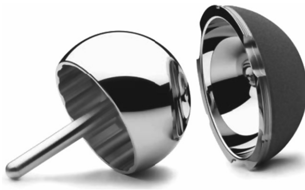
Fig. 1. The hybrid Durom hip surface replacement arthroplasty system with chrome-cobalt femoral head and acetabular cup (Zimmer, Warsaw, USA).

No significant differences were observed between the groups. Means (SD), P < 0.05 .